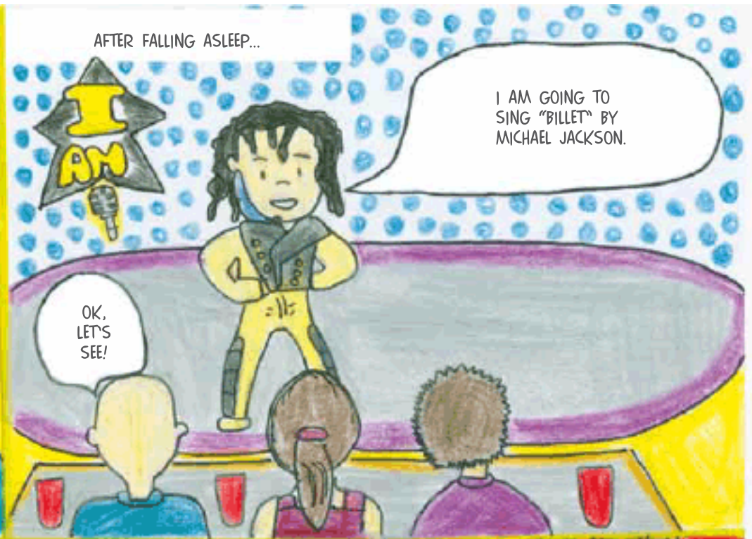
AFTER FALLING ASLEEP...

I WANT TO PARTICIPATE IN THE TV SHOW "I AM."