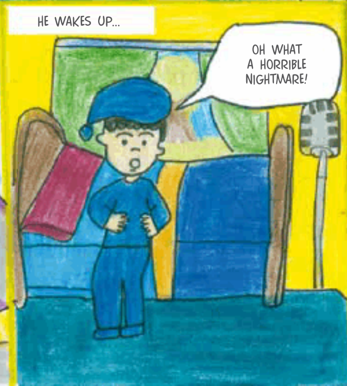
HE WAKES UP...